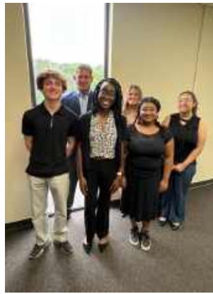
The 2024 Austin winners of the Bank of America Student Leaders program.