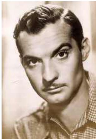
Austin-born Hollywood actor, Zachary Scott for whom the ZACH Theatre is named.

Ultimately named Zachary Scott Theatre Center in 1976 (honoring Austin-born Hollywood star Zachary Scott), the theater made its final move a few years later to its current home located at Riverside Drive and South Lamar.