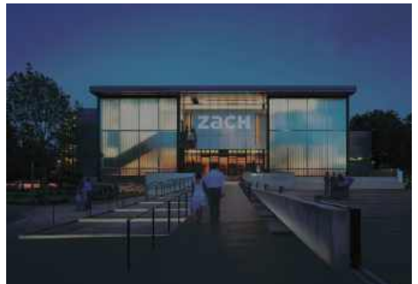
The beautiful ZACH Theatre on South Lamar

Finally, in 2011 Zach moved into its permanent, beautiful location on South Lamar Boulevard, right near Ladybird Lake. With 420 seats, the Topfer ZACH Theatre is a state-of-the-art facility designed by well-respected architect, Antoine Predock. The theater's varied programming includes classic and contemporary plays, musicals and original works. In addition to its major productions, the ZACH Theatre offers classes, camps, field trips and workshops for children and adults. Currently celebrating its 82nd season, the ZACH Theatre has something for every audience member. This fall the cast is performing "Beautiful, the Carol King Story." Why not pair two great things about Austin: music and theater? To catch the show and learn more about what ZACH Theatre has to offer, visit their box office webpage at: zachtheatre.org