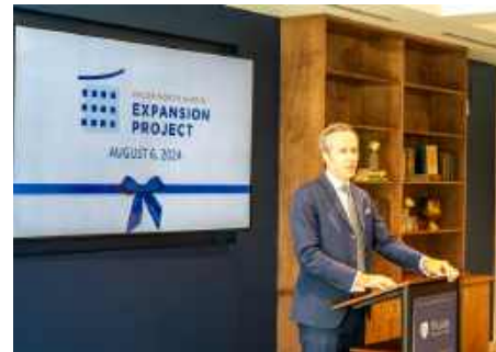
Valor North Austin expands its facilities.

For more information about enrollment and the programs offered at Valor North Austin, visit www.valoreducation.org/valornorthaustin .