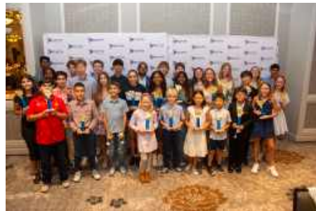
CATA Junior Awards Banquet 2025

"The Junior Awards Celebration is more than a recognition of performance — it's a celebration of character, effort, and the vibrant community that supports these young athletes," said a CATA spokesperson.